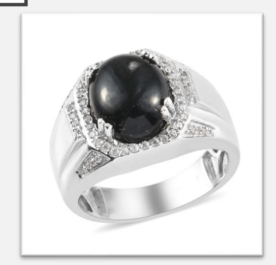
7914896 - CALIFORNIA BLACK JADE AND NATURAL WHITE ZIRCON MEN'S RING IN PLATINUM OVER STERLING SILVER 7.95 GRAMS 5.80 CTW